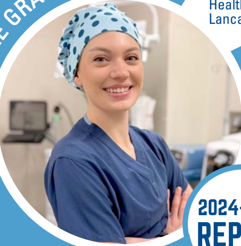
MADELYN Grant Regional Health Center Lancaster, WI