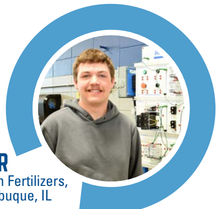
TYLER Nitrogen Fertilizers, East Dubuque, IL

26% of graduates were continuing their education at the time of the survey. • 65% of those at Southwest Tech • 28% of those at other Wisconsin institutions or high schools • 7% of those at institutions outside of Wisconsin