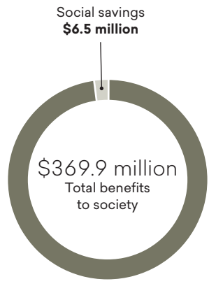
Added income $363.4 million